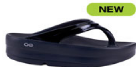
Black MARCH 2022