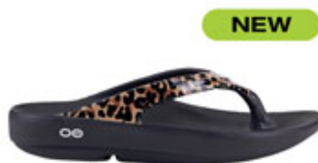
Black/Leopard FEB 2022