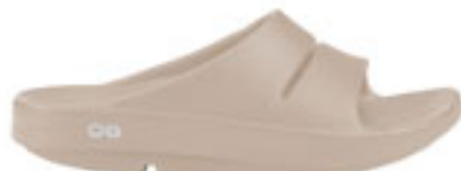
Nomad MAY 2022