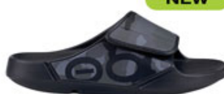
Black\Grey Camo MAY 2022