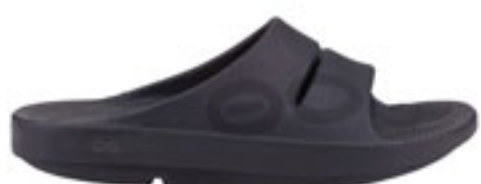
Matte Black FEB 2022