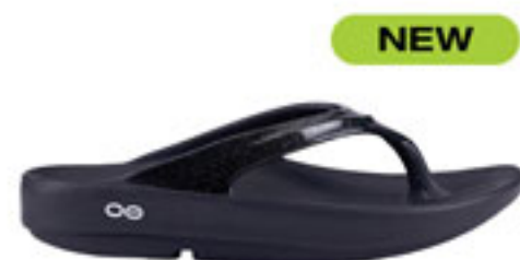
Platinum Sparkle FEB 2022