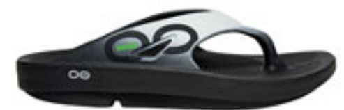
Cloud MAY 2022