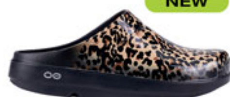
Black/Leopard MAY 2022

Sold in limited quantities, these exclusive graphic treatments are a great colourful addition to any wardrobe.