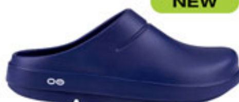
Navy JAN 2022