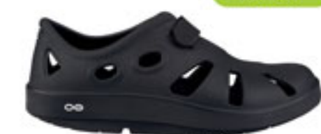
Black APRIL 2022

From post-hike campsite to city strolling, the OOCandoo brings active recovery to any adventure. Lightweight, versatile and floatable.