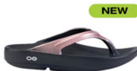
Rose Sparkle FEB 2022