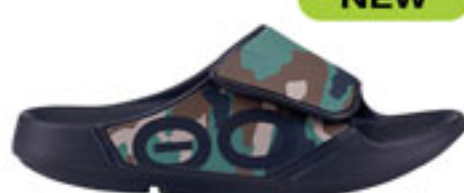
Woodland Camo MAY 2022