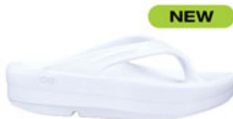
White MARCH 2022